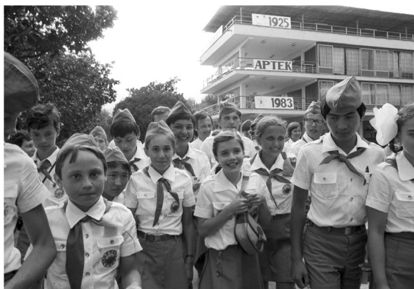
Figure 1 Caption: U.S. girl Samantha Smith in Artek.

‘I don’t want war, I want to study and live in peace’. 61 The children’s newspaper, Pionerskaya Pravda , closely covered the trip for the young Soviet audience and adopted Samantha as one of their own. By the time Samantha’s trip came to an end, the paper had received letters and drawings from many children addressed to Samantha. They were handed to her as a farewell gift. 62 Samantha rapidly became an icon of Soviet–American friendship for the Pioneer organizations – the friendly face of the ideological adversary.