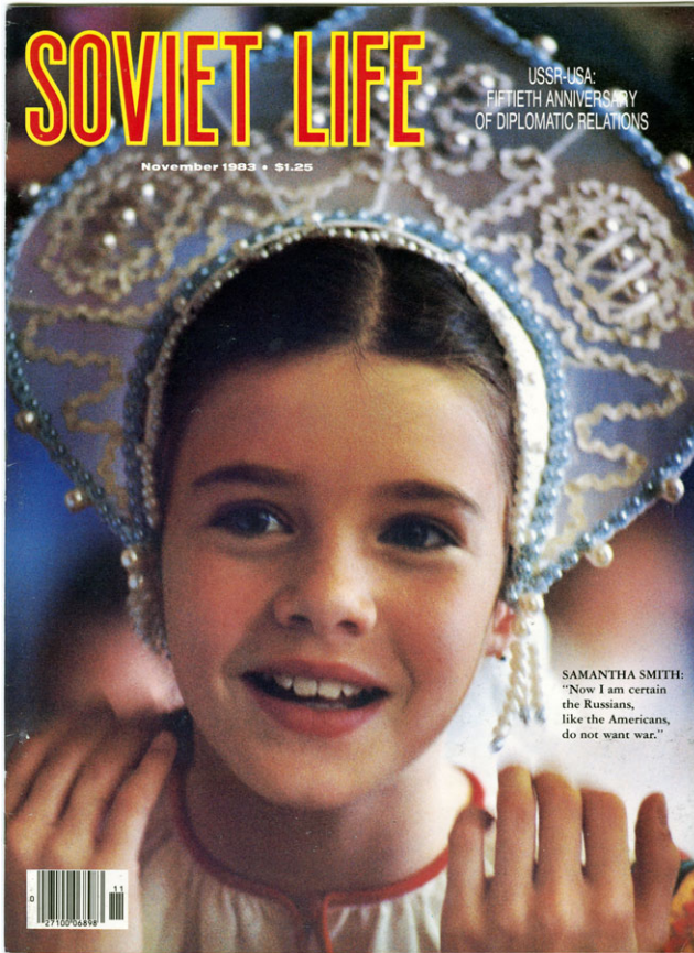
Figure 2 Caption: Cover of Soviet Life , November 1983. Maine State Museum 2010.37.104.4. [Colour figure can be viewed at wileyonlinelibrary.com ]